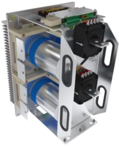
NATURAL AIR COOLED

Strukton is a worldwide recognized manufacturer of Traction Converters with over 100 years of technological advancements in the Rail Transportation Industry. Since 2014, AmePower has become the US and Canada Business Partner for Strukton Rolling Stock delivering Local Support and a wide variety of Pre-Design & Cost Effective Modular Traction Systems.